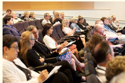
Large group lecture