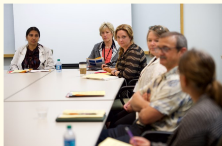
Small group case-discussions