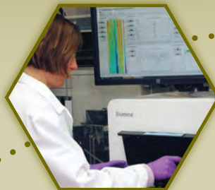
3 Sequencing your DNA