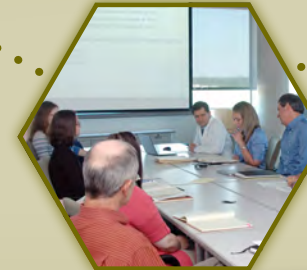
5 Interpreting your DNA