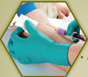
1 Your visit to the doctor's office