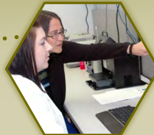
4 Analyzing your DNA