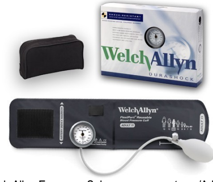
Welch Allyn Economy Sphygmomanometer w/Adult Cuff $42.00